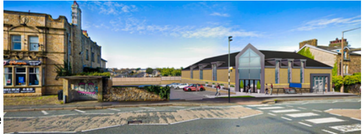
Artist's impression of the proposed new retail development, viewed from the opposite side of Bowerham Road

An earlier application for a mix of retail units and student accommodation was refused permission, and the applicant's appeal was